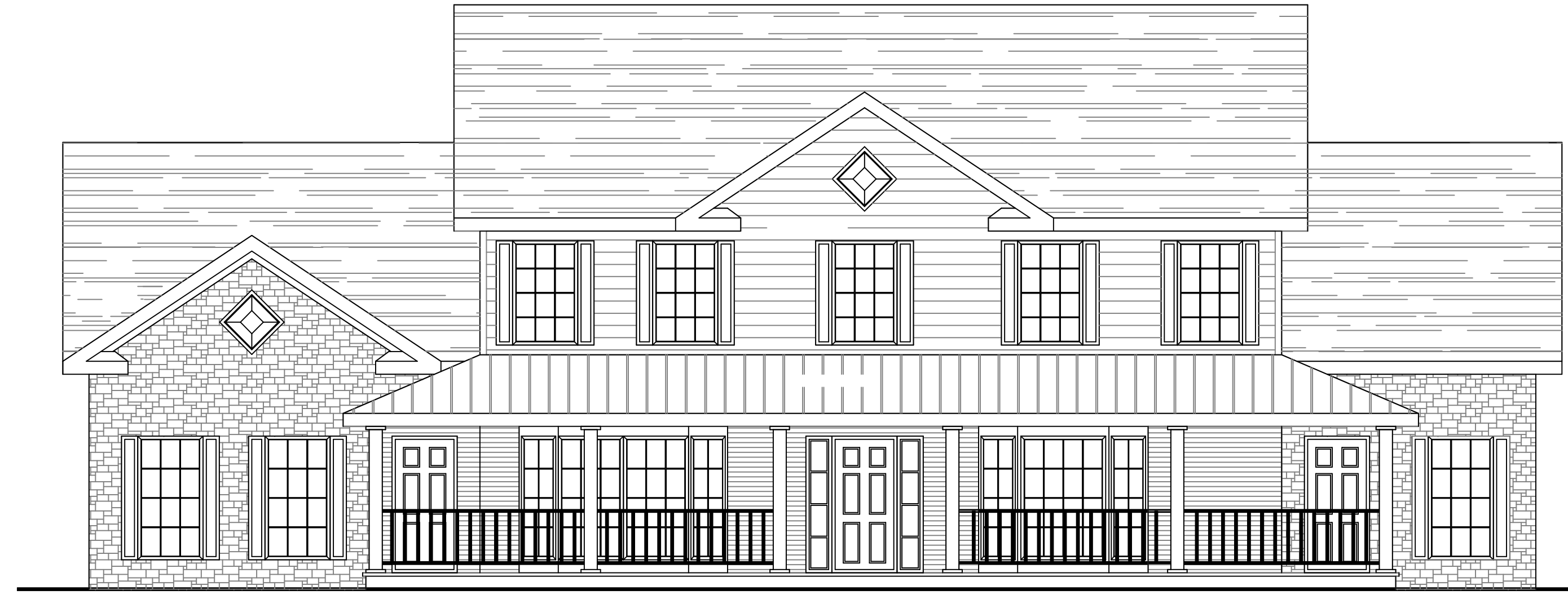
FRONT ELEVATION NOT TO SCALE

FIRST FLOOR HEATED SQ. FT. = 2489 SECOND FLOOR HEATED SQ. FT. = 1041 TOTAL HEATED SQUARE FEET = 4530 FIRST FLOOR 8'-0" CEILING HEIGHT SECOND FLOOR 9'-0" CEILING HEIGHT